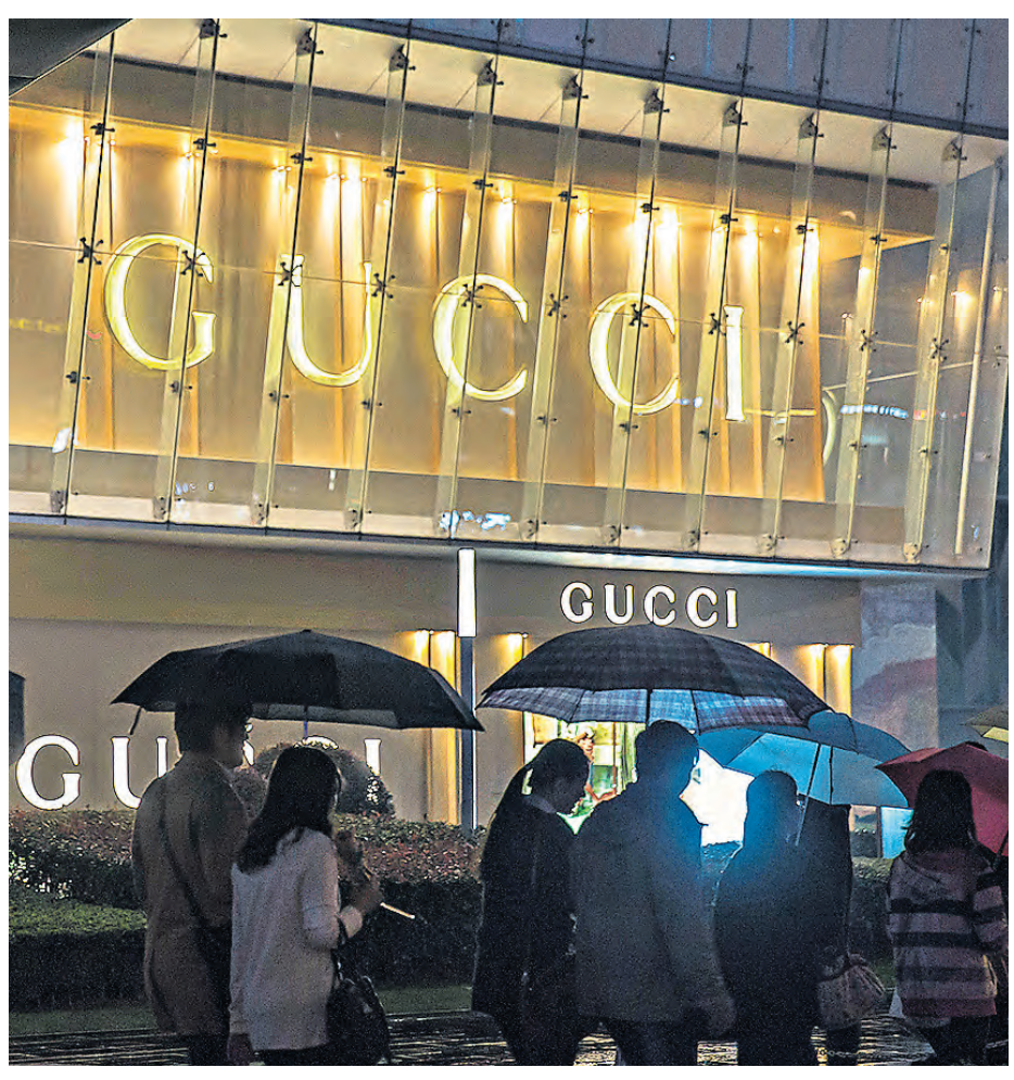
The Chinese appetite for luxury is reflected in the Gucci luxury goods store in Suzhou Village

The retailer already has a deep understanding of Chinese consumer tastes due to the sheer volume of people that flock to Bicester Village – the UK's second most popular destination for tourists from China after Buckingham Palace.