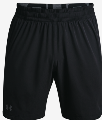
1362289-001 UA Elevated Woven 2.0 Shorts RRP £36/ Village £24,99