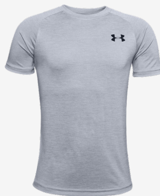
1352783-011 UA Tech 2.0 SS-GRY RRP £16/ Village £10,99