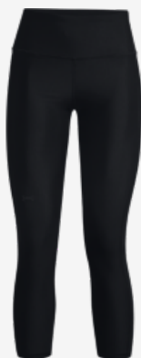
1367025-001 UA Amour HG 7/8 Legging RRP £36/ Village £24,99