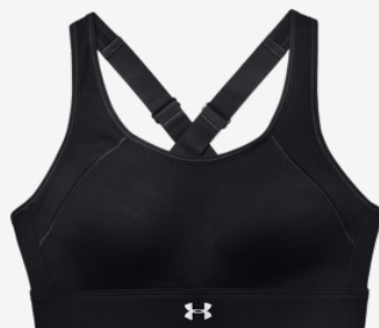
1321896-001 DFO Reflect High RRP £42/ Village £28,99