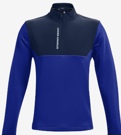
1366280-400 UA Storm Daytona HZ-BLU RRP £75/ Village £51,99