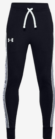
1351804-001 Rival Terry Pants RRP £34/ Village £22,99