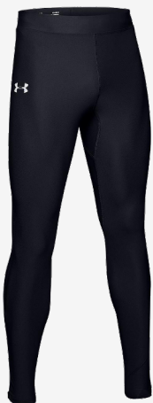
1329355-002 UA Qualifier HeatGear Tight-BLK RRP £60/ Village £41,99