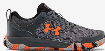
3022865-100 UA GS Mainshock 2 RRP £60/ Village £41,99