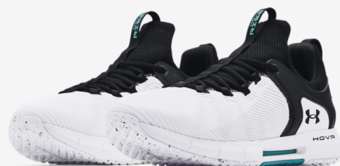
3023009-103 UA HOVR Rise 2 RRP £85/ Village £58,99