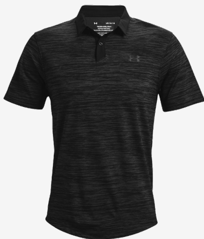
1370664-021 UA Iso-Chill Twist Polo-BLK RRP £60/ Village £41,99