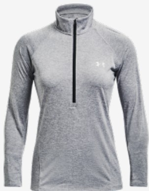
1270525-035 Tech 1/2 Zip - Twist RRP £35/ Village £23,99