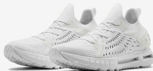
3022590-100 UA HOVR Phantom RN RRP £120/ Village £83,99