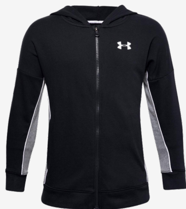
1351786-001 Rival Terry FZ RRP £36/ Village £24,99