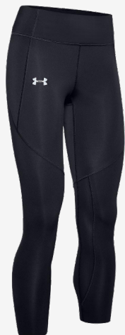
1344969-001 UA Speedpocket Ankle Legging-BLK RRP £65/ Village £44,99