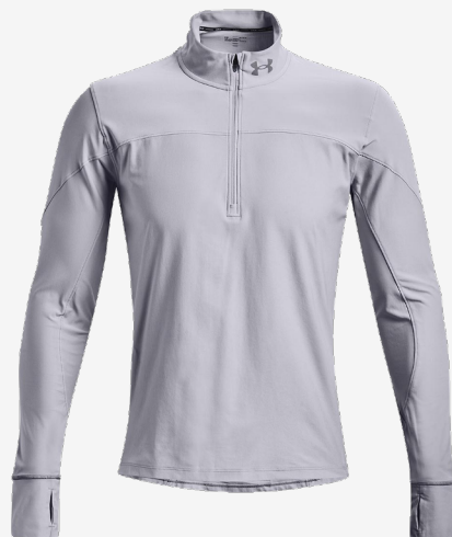
1326595-011 UA QUALIFIER HALF ZIP-GRY RRP £55/ Village £37,99