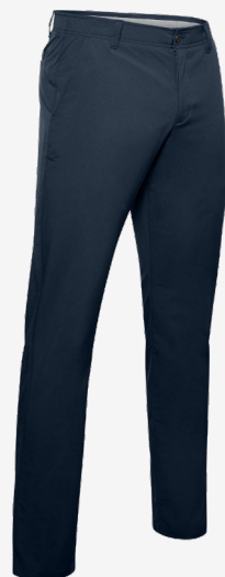
1342264-408 UA Match Play Taper Pant-NVY RRP £60/ Village £41,99