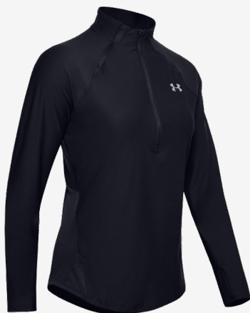
1351185-001 UA Mileage Half Zip-BLK RRP £55/ Village £37,99