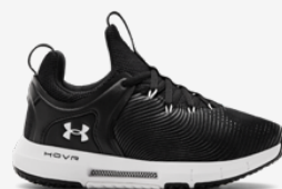
3023010-001 UA W HOVR Rise 2-BLK RRP £85/ Village £58,99