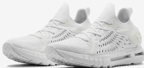
3022600-101 UA W HOVR Phantom RN-WHT RRP £120/ Village £83,99