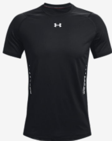
1370655-001 UA HG Vent Fitted SS RRP £40/ Village £27,99