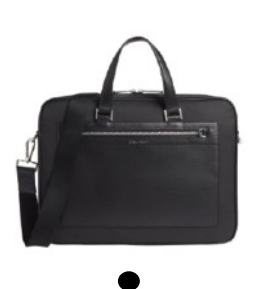
CLASSIC REPREVE LAPTOP BAG WITH POCKET