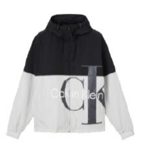
BOLD LOGO BLOCKED WINDBREAKER