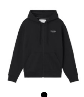
STACKED LOGO ZIP-THROUGH