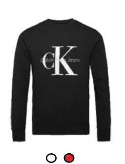
EO/ TRUE ICON C-NECK HEAVYWEIGH KNIT