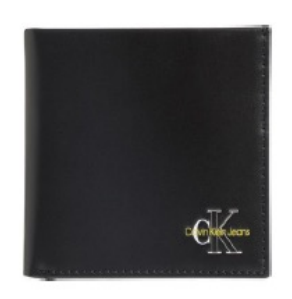
THREE TONE BIFOLD WITH COIN POCKET