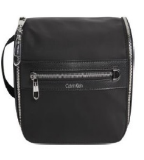
CLASSIC REPREVE WASHBAG WITH HANGER