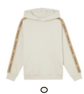
CONTRAST TAPE HOODIE