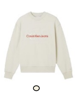
TWO TONE MONOGRAM CREW NECK