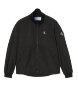
MIX MEDIA BOMBER