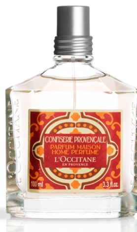
Candied Fruit Home Spray 100ml €15.60 (worth €26)