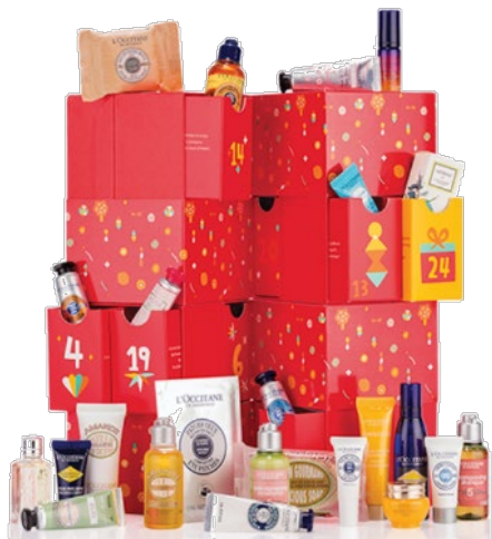
Luxury Advent Calendar €64 (worth €114)