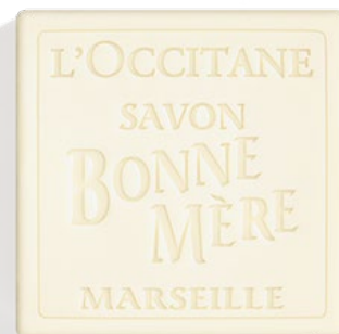
Bonne Mère Milk Soap 100g €4.30 (worth €6.50)