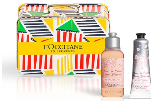
Cherry Suitcase Mini Duo €6 (worth €9.50)