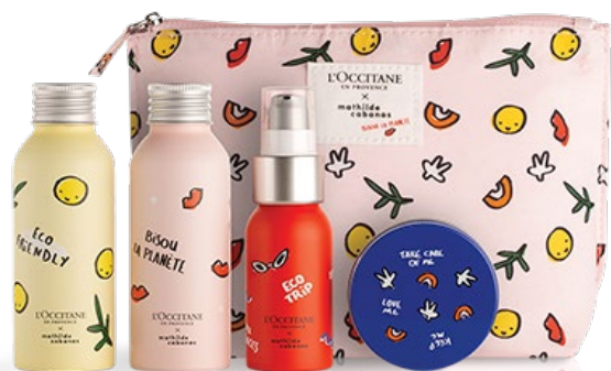
Refillable Eco Travel Kit €12 (worth €18)