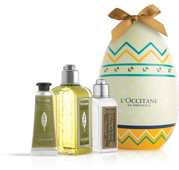
Verbena Easter Egg €12 (worth €18)