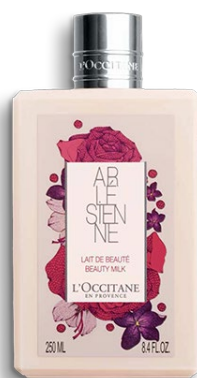
Arlésienne Body Lotion 250ml €13.50 (worth €27)