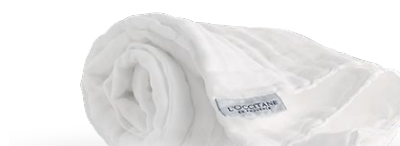
Baby Reusable Cotton Nappy €3.70 (worth €5.50)