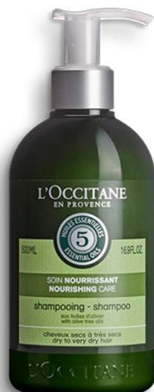
Nourishing Shampoo 500ml €20.60 (worth €30)