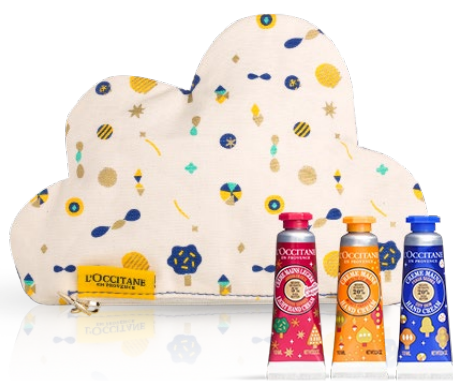
Cloud Mini Hand Cream Trio €10.50 (worth €15.80)