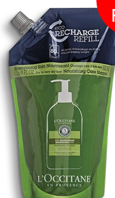
Nourishing Conditioner Refill 500ml €10 (worth €31.50)