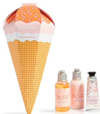
Cherry Blossom Ice Cream €8.50 (worth €11.50)