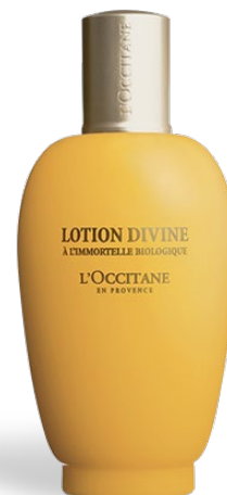
Immortelle Divine Lotion 200ml €25 (worth €42)