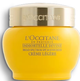
Immortelle Divine SPF Cream 50ml €71.20 (worth €89)