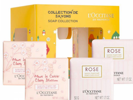
Floral Soap Quattro 50g €12.50 (worth €22)