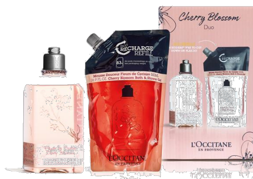
Cherry Blossom Shower Duo €30 (worth €45)