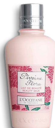
Peony Body Milk 250ml €13.50 (worth €27)