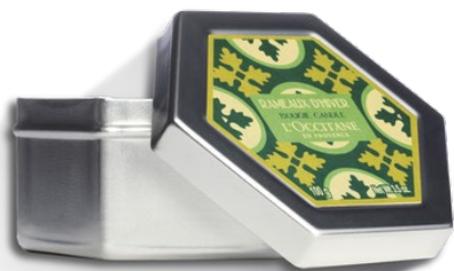
Winter Forest Hexagon Candle 100g €14 (worth €21)