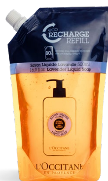
Shea Lavender Liquid Soap Refill 500ml €14.60 (worth €20)