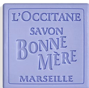
Bonne Mère Lavender Soap 100g €4.30 (worth €6.50)