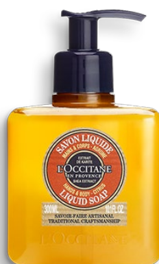
Shea Citrus Liquid Soap 300ml €12.60 (worth €18)