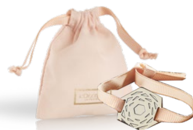
Rose Ribbon Bracelet €2.60 (worth €3.90)