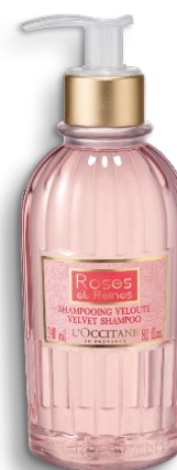
Rose Shampoo 240ml €9 (worth €18.50)