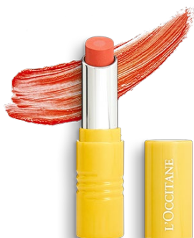
040 Gor-juice pomelo Glossy