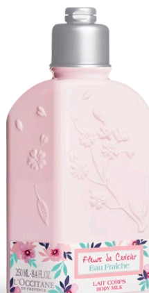
Cherry Blossom Eau Fraiche Body Milk 250ml €13.50 (worth €27)