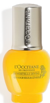
Immortelle Divine Eyes 15ml €47.20 (worth €59)