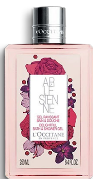
Arlésienne Shower Gel 250ml €12.30 (worth €18.50)