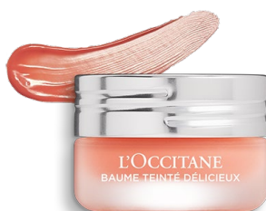
Carrot Fizz tinted balm