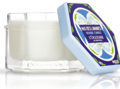
Lavender Glass Hexagon Candle 100g €18.70 (worth €28)