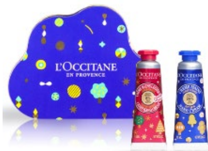
Festive Mini Hand Cream Duo €6 (worth €9.50)