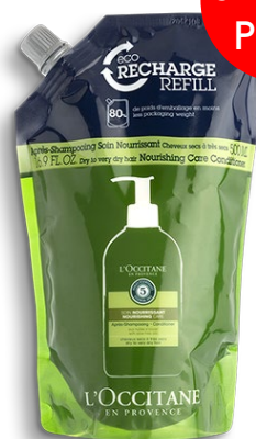
Nourishing Shampoo Refill 500ml €15 (worth €26.50)