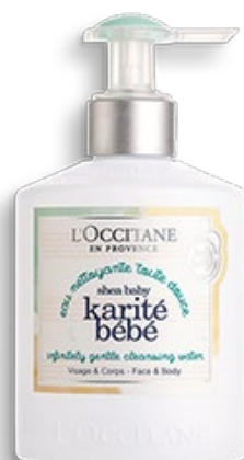
Infinitely Gentle Cleansing Water 300ml €15 (worth €22.50)