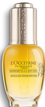
Immortelle Divine Youth Oil 30ml €71.20 (worth €89)