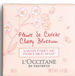
Cherry Blossom Soap 50g €3.60 (worth €5.50)