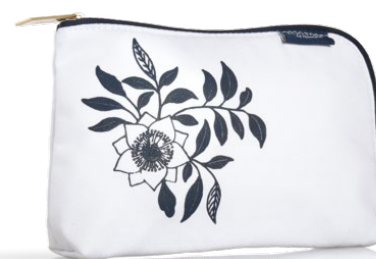
Floral Navy Cosmetic bag €2.20 (worth €3.30)