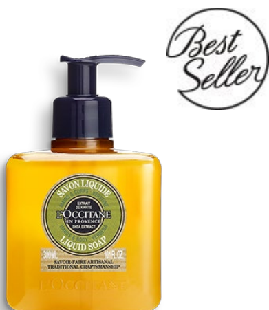
Shea Verbena Liquid Soap 300ml €17.10 (worth €18)