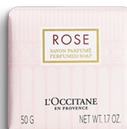
Rose Soap 50g €3.60 (worth €5.50)