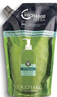
Purifying Shampoo Refill 500ml €18.30 (worth €26.50)

A Refill can save up to 91% of plastic compared to the original product packaging?