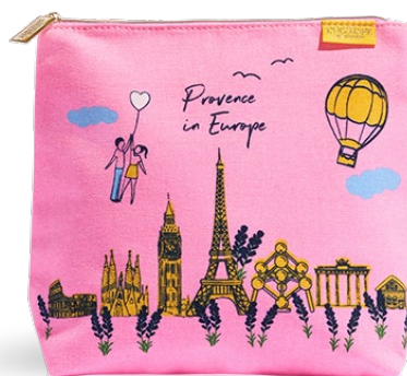
Provence in Europe large Cosmetic bag €2.20 (worth €4)