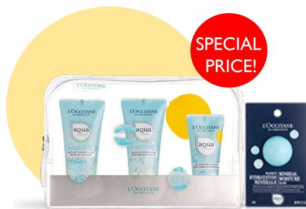
Réotier Face Care Set €10 (worth €32)