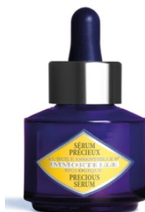
Immortelle Precious Serum 30ml €39 (worth €54)