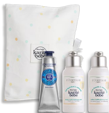
Mum & Baby Pamper Set €20.30 (worth €30)