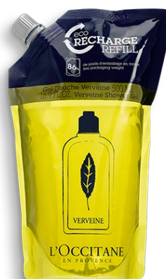
Verbena Shower Gel Refill 500ml €17.60 (worth €26.50)