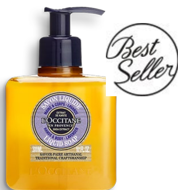
Shea Lavender Liquid Soap 300ml €17.10 (worth €18)