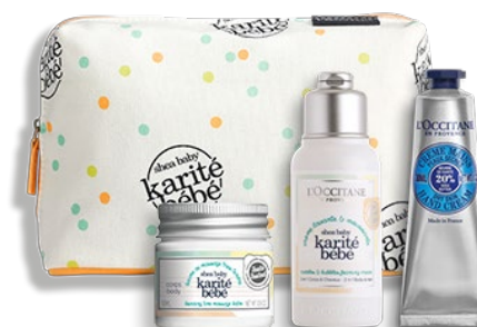
Mum & Baby on-the-go set €24 (worth €36)