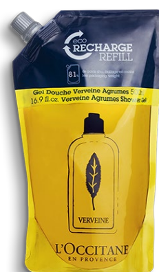
Citrus Verbena Shower Gel Refill 500ml €17.60 (worth €26.50)

Find out more about our commitment to reducing waste at this link: REDUCING WASTE