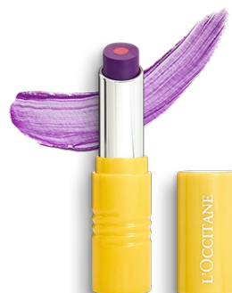
080 Provence calling Glossy