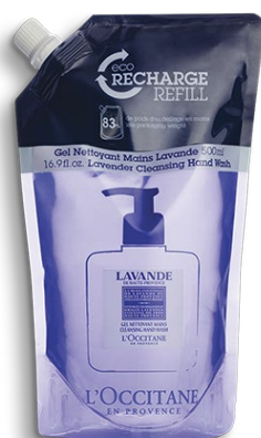
Lavender Liquid Soap Refill 500ml €14.60 (worth €20)