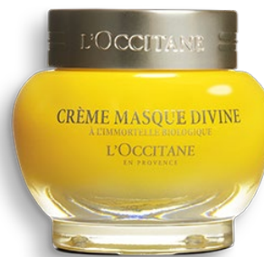
Immortelle Divine Mask 65ml €84 (worth €104)