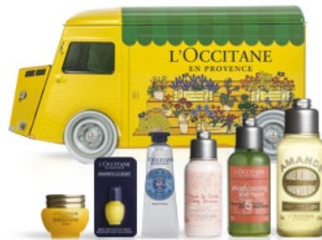
Truck of Treats €21.90 (worth €35)