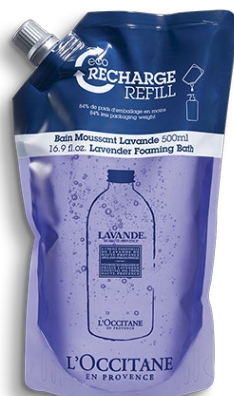
Lavender Foaming Bath Refill 500ml €15 (worth €21)