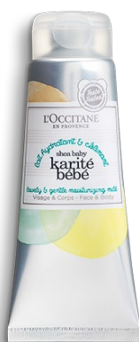
Lovely & Gentle Moisturising Milk 100ml €12.60 (worth €19)