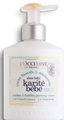
Cuddles & Bubbles Foaming Cream 300ml €15 (worth €22.50)