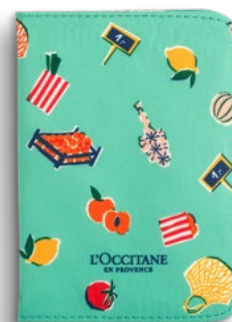
Summer Passport Holder €2.50 (worth €3.90)