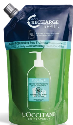
Revitalising Conditioner Refill 500ml €21.60 (worth £31.50)