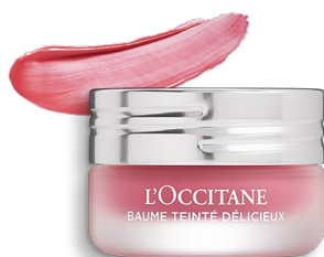
Pink Calisson tinted balm