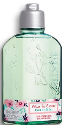
Cherry Blossom Eau Fraiche Shower Gel 250ml €12.30 (worth €18.50)