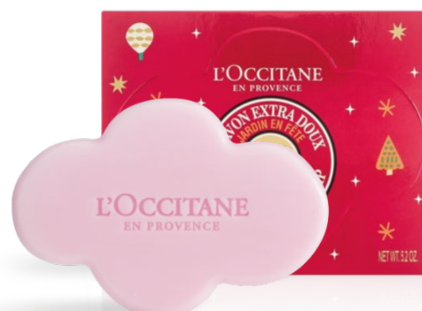
Festive Garden Soap 50g €6 (worth €9)