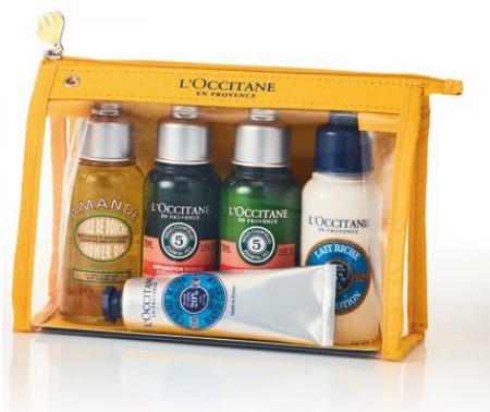
Best of Provence Set €29 (worth €46)