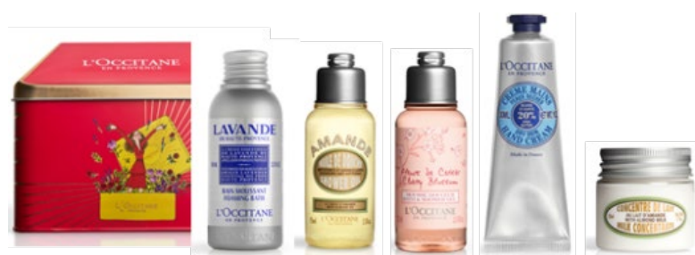
House Tin Set €29 (worth €50)