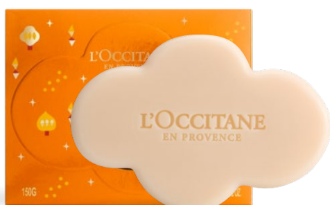
Honey Harvest Soap 50g €6 (worth €9)