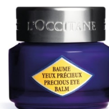
Immortelle Precious Eye Balm 15ml €21 (worth €42)