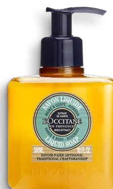
Shea Rosemary Liquid Soap 300ml €12.60 (worth €18)