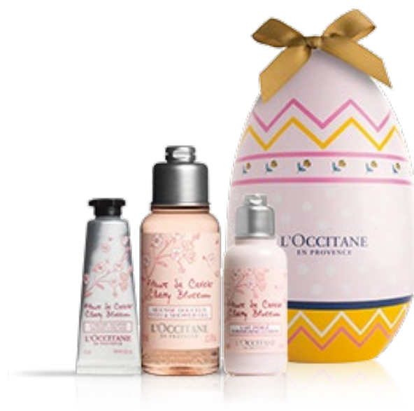
Cherry Blossom Easter Egg €12 (worth €18)