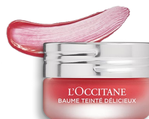
Miss Grenadine Tinted balm