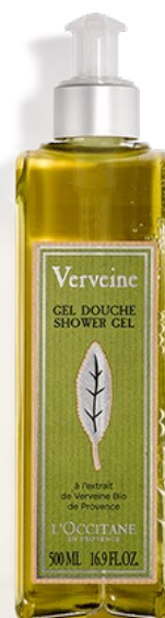
Verbena Shower Gel 500ml €24.40 (worth €30.50)