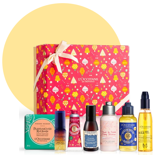
Luxury Travel Collection €24.50 (worth €35)