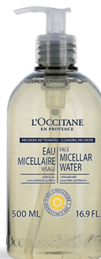
Face Micellar Water 500ml €26 (worth €38.80)