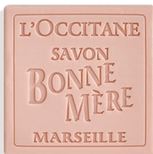
Bonne Mère Rose Soap 100g €4.30 (worth €6.50)