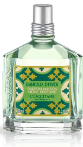
Winter Forest Home Spray 100ml €15.60 (worth €26)