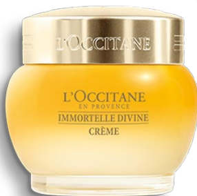
Immortelle Divine Cream 50ml €71.20 (worth €89)