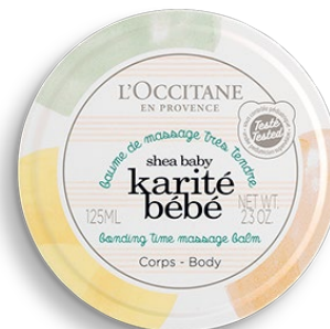
Bonding Time Massage Balm 125ml €19.30 (worth €26.50)