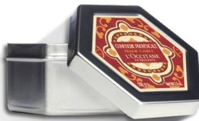
Candied Fruit Hexagon Candle 100g €14 (worth €21)